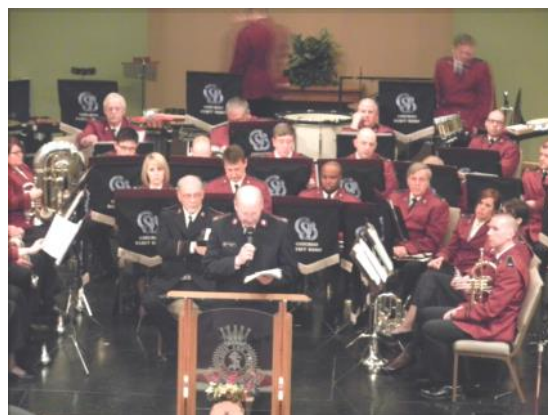
Picture of the Chicago Staff Band when they performed at the Fort Wayne Corps on Saturday, March 15th.