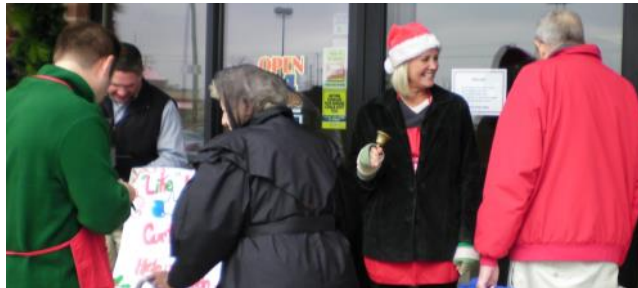
Many customers came by to chat and ask for autographs.