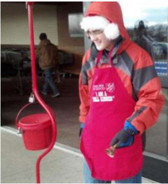
How I set out to ring a bell and found unbridled support from my community.